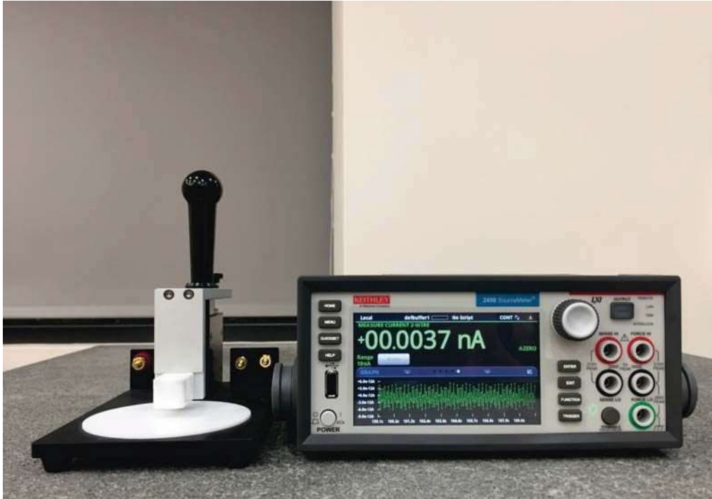
R-2 paired with Keithley 2450 SMU