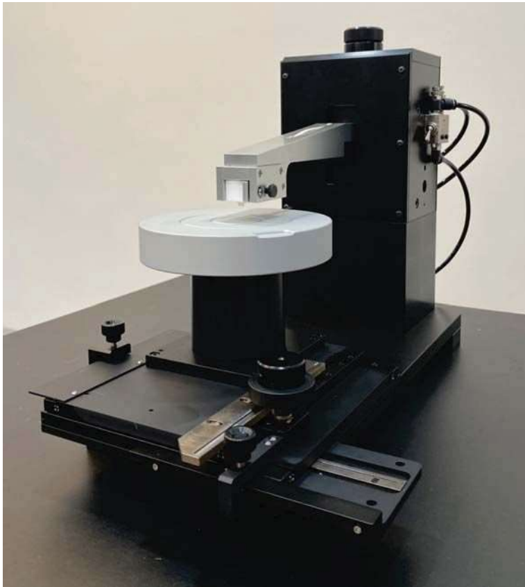
SR-4 equipped with chuck stage and hot chuck